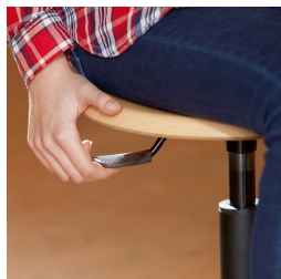
Height adjustment by safety gas spring