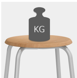
Robust 4-legged frame