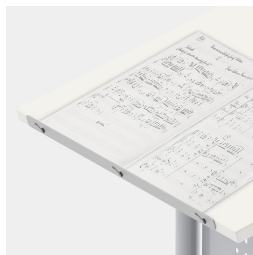
Including front book stop bar