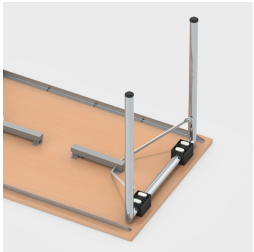
Easy folding of the table legs