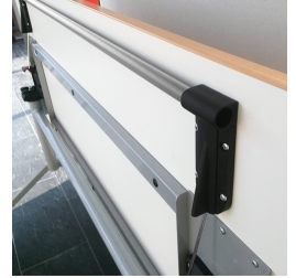
Triggering of the folding function by means of 2-hand safety operation