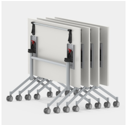
Space saving nestable