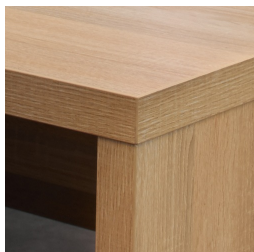
Surface melamine coated with robust plastic edge