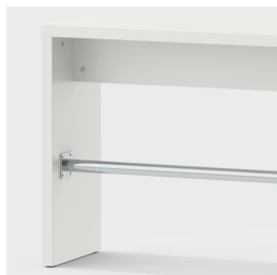
Footrest included for comfortable resting of the feet