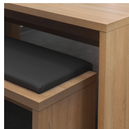
Optionally with comfortable bench support