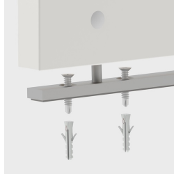
Optionally with floor mounting