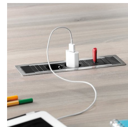
Optionally two floor sockets with USB port or network connection: centered