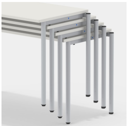
Stackable up to 4 tables due to special frame design