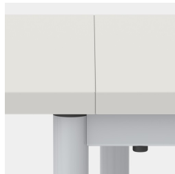
Table tops can be placed together without joints