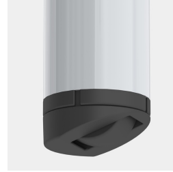
Optional frame mobile by means of 2 rollers