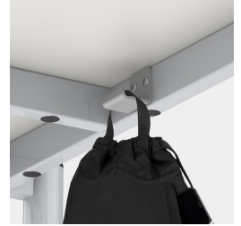
Optionally with one folder hook per seat