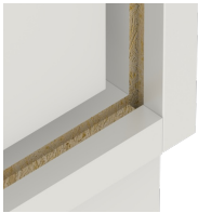
Resistance to warping due to 8 mm thick back wall