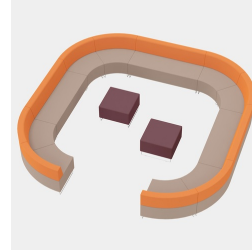
Can be individually extended with MAZE and straight DOMINO seating elements