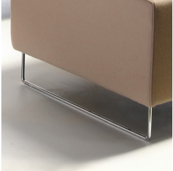
Stable sled frame optionally chrome-plated