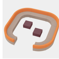
Can be individually extended with MAZE and straight DOMINO seating elements