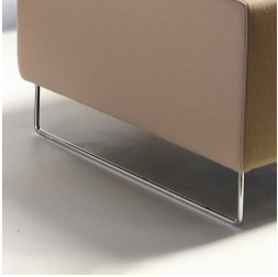
Stable sled frame optionally chrome-plated