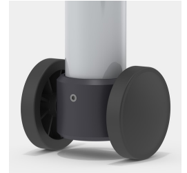
Optional frame mobile by means of 2 fixed castors