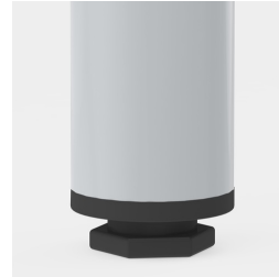
Floor saver with level compensation compensates for uneven floors