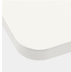
Optional table top with 40 mm corner radius