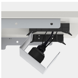
Concealed cable management through foldable cable tray