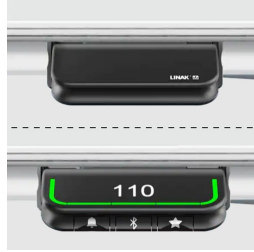
Manual switch with up and down function or optional memory function