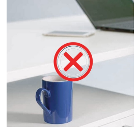
Collision protection minimizes the risk of damage when moving up and down