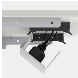
Concealed cable management through foldable cable tray