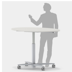
Can also be used as a mobile lectern