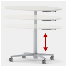
Infinitely height adjustable in the range 71-110 cm