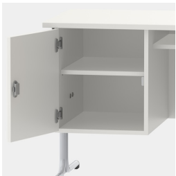
Base cabinet includes one shelf, lockable by means of security lock