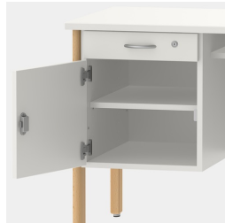
Base cabinet includes drawer, lockable by means of safety lock