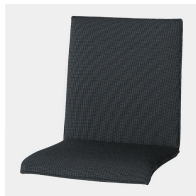
Body contoured seat shell with full upholstery