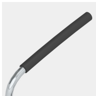
Including armrest with black softgrip cover