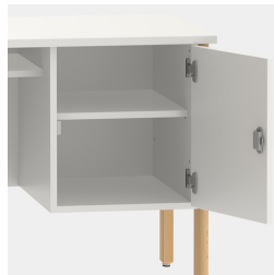
Base cabinet includes one shelf, lockable by means of security lock