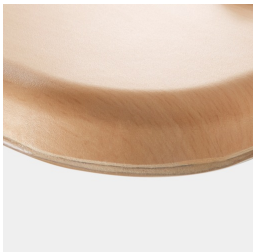
Optional WOODMARK table top in shatterproof quality