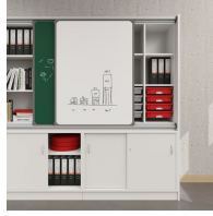
Shelf attachment with tidy boxes behind the panels