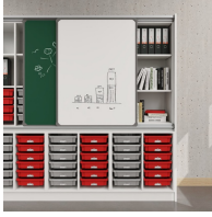
Sliding panel with aluminum guide rails and additional storage space behind the panels