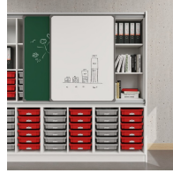
Sliding panel with aluminum guide rails and additional storage space behind the panels