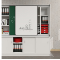
Shelf attachment with tidy boxes behind the panels