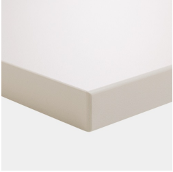
Board material melamine coated with robust plastic edge