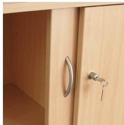
Smooth sliding doors