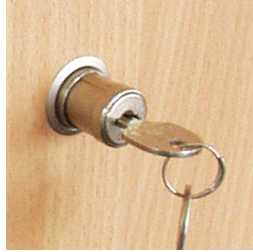
Sliding doors lockable