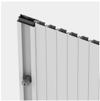
Stable guide rails