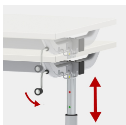
Height adjustable by means of an easily operated hand crank