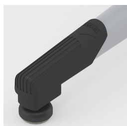
Floor protector with integrated step protection and level compensation