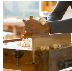
Solid beech wood from sustainable forestry with water-based varnish