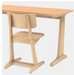
Due to C-shape no disturbance of the table legs when getting in and out of the table