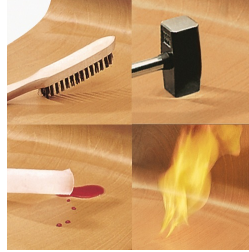
Indestructible PAGHOLZ® tabletop, scratch, break and impact resistant; flame retardant