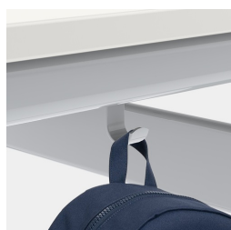
Includes one satchel hook per seat