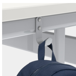
Includes one satchel hook per seat