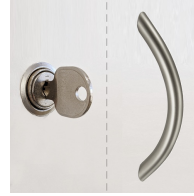
1 OH cabinet with handle or lock