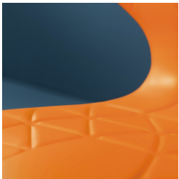
Seat shell with integrated ventilation channel