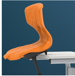
Table suspension protects the table when it is stacked