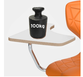
Robust 4-leg frame with writing surface can be loaded up to 100 kg