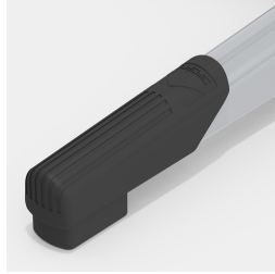
Robust plastic floor protectors with step protection