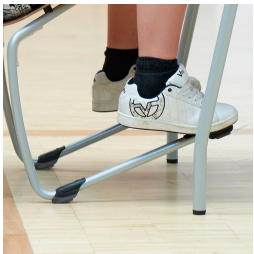
Robust C-shape frame with A2S FLOORSAFE® floor protectors