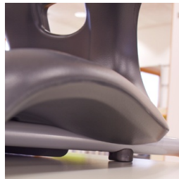
Plate protectors protect the table when stacking up