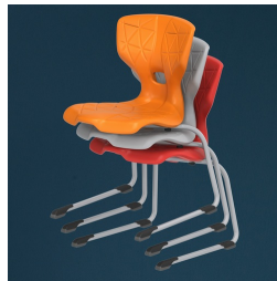
Stackable up to 3 chairs (without upholstery)