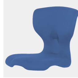
Optional seat shell fully upholstered from size 5 onwards