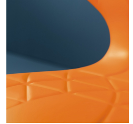
Seat shell with integrated ventilation channel