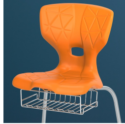
Optionally with book tray from size 5