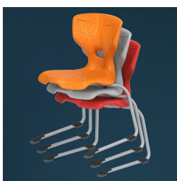
Stackable up to 3 chairs (without upholstery)