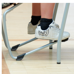
Robust C-shape frame with A2S FLOORSAFE® floor protectors