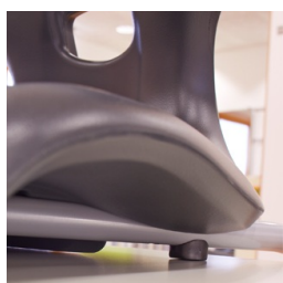
Plate protectors protect the table when stacking up