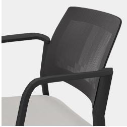
Ergonomically shaped, breathable mesh backrest