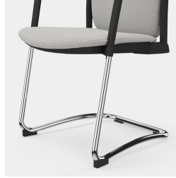
Robust cantilever frame