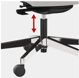
Stepless gas lift height adjustment includes seat depth suspension