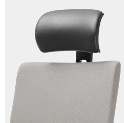
Headrest with leather cover: height and angle of inclination adjustable