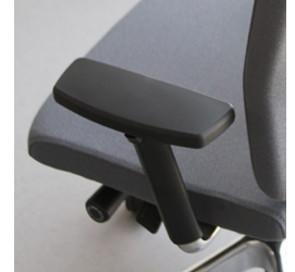
Armrest three-dimensionally adjustable