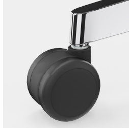
Load-dependent braked safety casters prevent unintentional rolling away