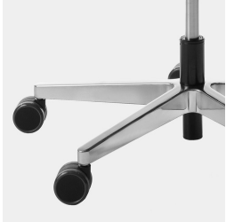
Elegant, high-quality aluminum base