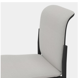
Ergonomically shaped backrest