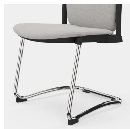
Robust cantilever frame