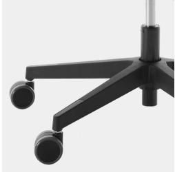
Elegant, sturdy black plastic base