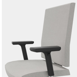
Ergonomically shaped backrest