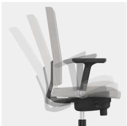
Synchronous mechanism: Spring force or resistance adjustable to body weight