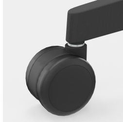
Load-dependent braked safety casters prevent unintentional rolling away