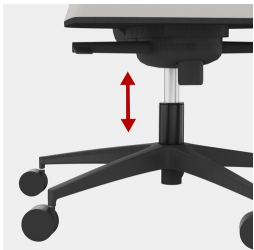
Stepless gas lift height adjustment