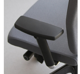
Height adjustable armrests