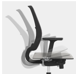
Synchronous mechanism: Spring force or resistance adjustable to body weight