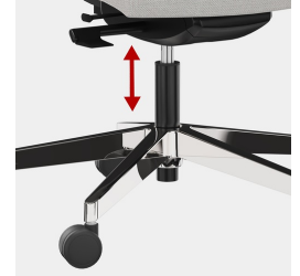
Stepless gas lift height adjustment includes seat depth suspension