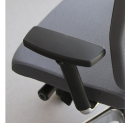
Armrest three-dimensionally adjustable