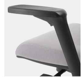
Armrest three-dimensionally adjustable