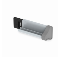
Invisible rail fastening compensates for wall unevenness