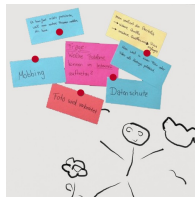
Magnetic surface can be written on with whiteboard pens