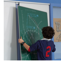
Removable board elements