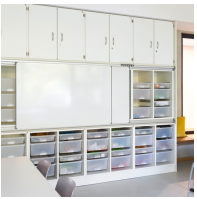
Can be mounted on cabinet wall