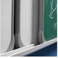
Board elements with ASSODUR® edge can be moved one behind the other