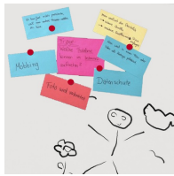
Magnetic surface can be written on with whiteboard pens