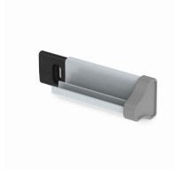
Invisible rail fastening compensates for wall unevenness