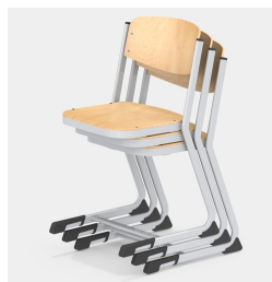
Stackable up to 3 chairs (size 7)