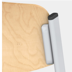
Seat and back concealed screwed