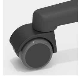
Optionally with load-dependent braked casters