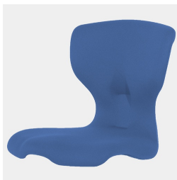
Optional seat shell fully upholstered from size 5 onwards