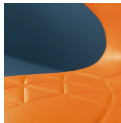
Seat shell with integrated ventilation channel