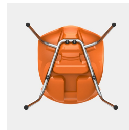
Robust 4-leg frame