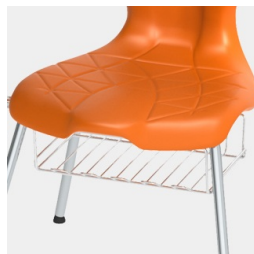
Optionally with book tray from size 5