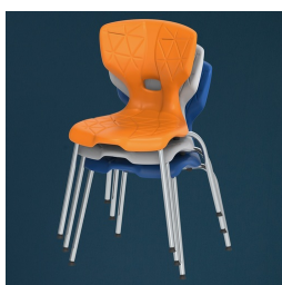
Stackable up to 3 chairs (without upholstery)