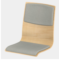
Optionally with seat and backrest upholstery