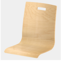
Optionally with rectangular grip hole (not with backrest upholstery)