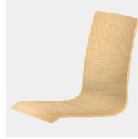
Body contoured seat shell