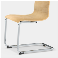
Robust cantilever frame