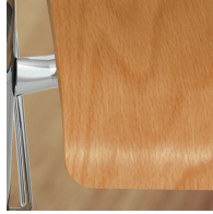
Seat shell environmentally friendly lacquered with water-based varnish