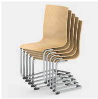
Stackable up to 5 chairs (without upholstery)